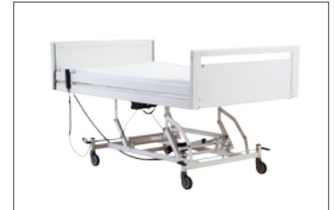
Raising the lying surface