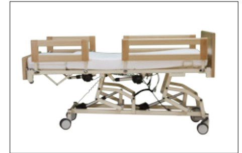
Raising the lying surface