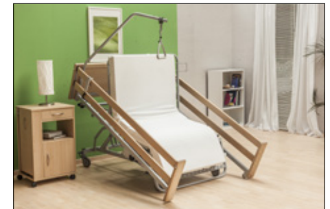
forza aktiv mit durchgehenden Seitengittern