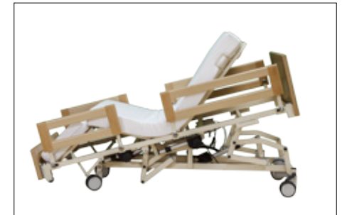
Sitting and nursing position