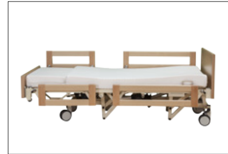
Lowering the lying surface/lying position