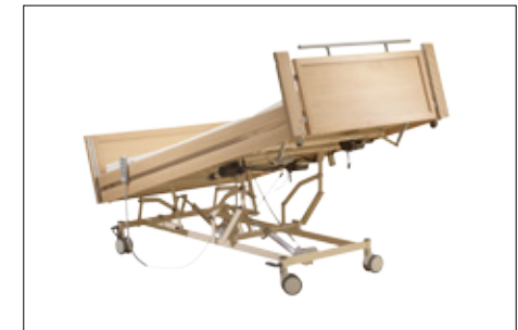
Lowering head end (Anti-Trendelenburg)