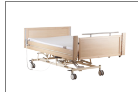
Lowering the lying surface