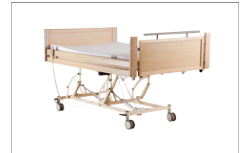
Raising the lying surface