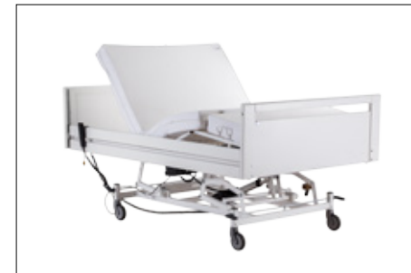
Head and foot section adjustment