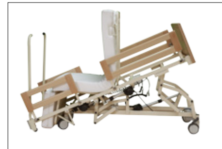
Sitting and exit position