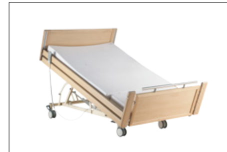
Lowering foot end (Trendelenburg)