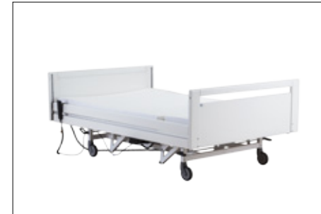
Setting the lying surface low